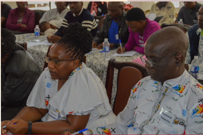
One of the participating couples follows the proceedings.

with skill and pastoral sensitivity. Their international perspective lent added richness to the dialogue.