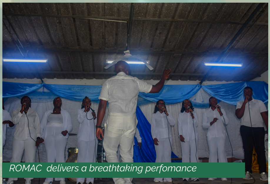
ROMAC delivers a breathtaking performance