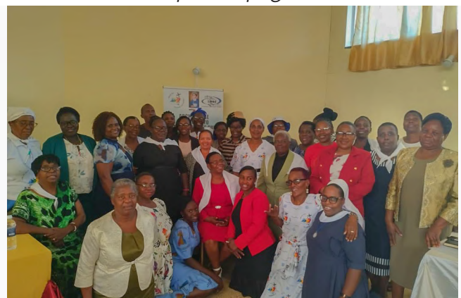
Nurses pose for a photo after the gathering