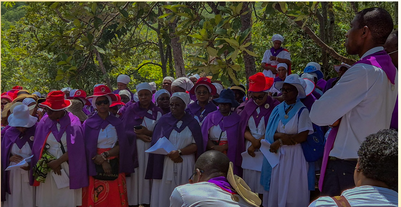
In Hope, members of the Inner City Deanery Mwoyo Musande guild solemnly pray at the Shrine of Our Lady of Perpetual Help- a pilgrimage shrine

"The righteous cry out, and the Lord hears them; He delivers them from all their troubles. The Lord is close to the brokenhearted and saves those who are crushed in spirit." — Psalm 34:17–18