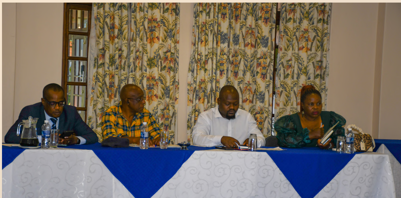
Officials from the Ministry of Public Service, Labour and Social Welfare follow the proceedings.

Strategies will now be put in place to bring that vision to life.