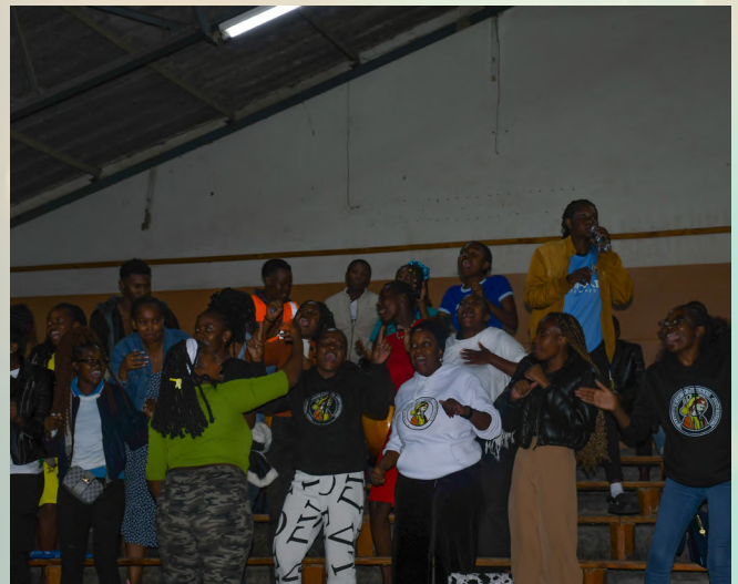
Participants lift their voices in harmony

Though there were a few logistical challenges—mainly due to the large number of