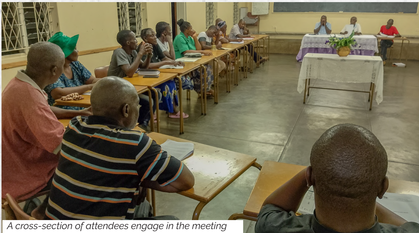
A cross-section of attendees engage in the meeting

By Quegas Mutale in Binga, Diocese of Hwange