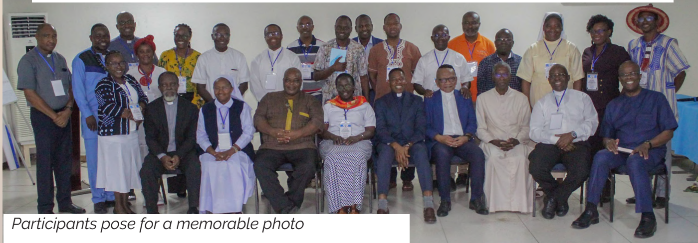
Participants pose for a memorable photo

The Symposium of Episcopal Conferences of Africa and Madagascar (SECAM) organised a seminar for on the "Vision of the Church-Family of God in Africa and its islands for the next 25 years: 2025-2050". At the end of this seminar, on the 2nd and 3rd April 2025 in Accra, Ghana, a document was drawn up and will be sent to the bishops for deliberation.