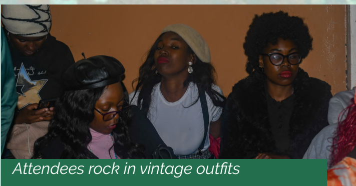
Attendees rock in vintage outfits