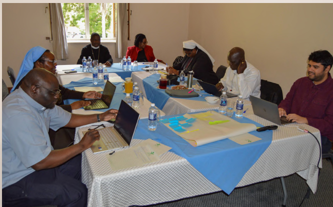
Participants during the training session

The Education and Safeguarding Commission of the Zimbabwe Catholic Bishops' Conference (ZCBC) recently underwent strategic training, from 28 April to 2 May 2025, to scale up its Safe Schools Pro-