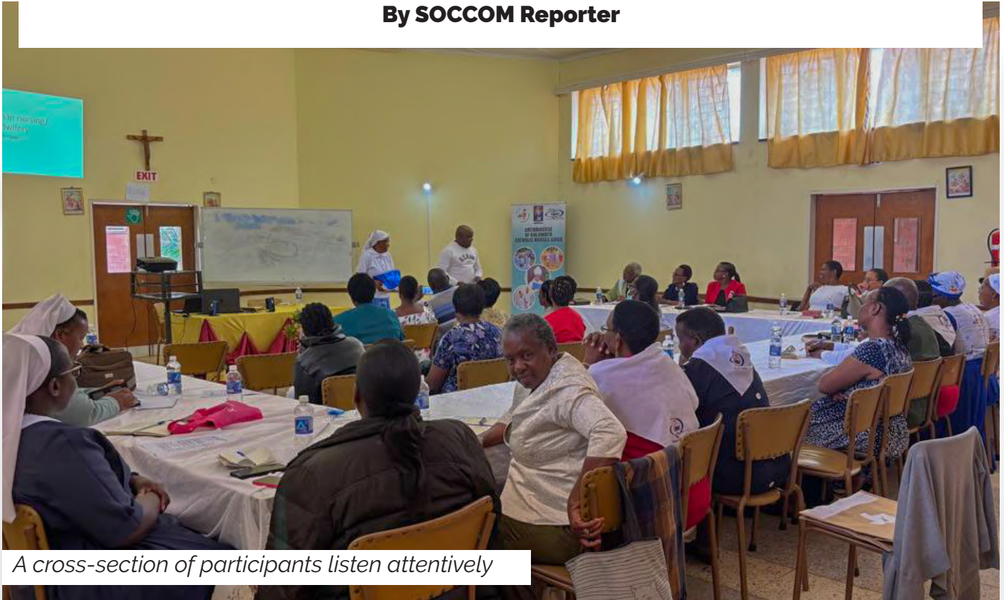
A cross-section of participants listen attentively

The Catholic Nurses' Guild (CNG) of the Archdiocese of Bulawayo gathered at Emthonjeni Pastoral Centre from 4th to 6th April 2025 to commemorate the Jubilee of the Sick and Health Care Workers—an occasion proclaimed by His Holiness Pope Francis in the Jubilee 2025 General Calendar.