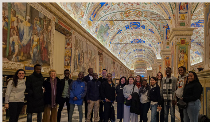
Faith communicators at Vatican Museum near the sistine chapel

The young communicators described Pope Francis as deeply humble, compassionate, and close to the poor and marginalized. "Pope