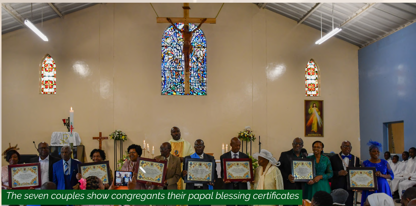
The seven couples show congregants their papal blessing certificates