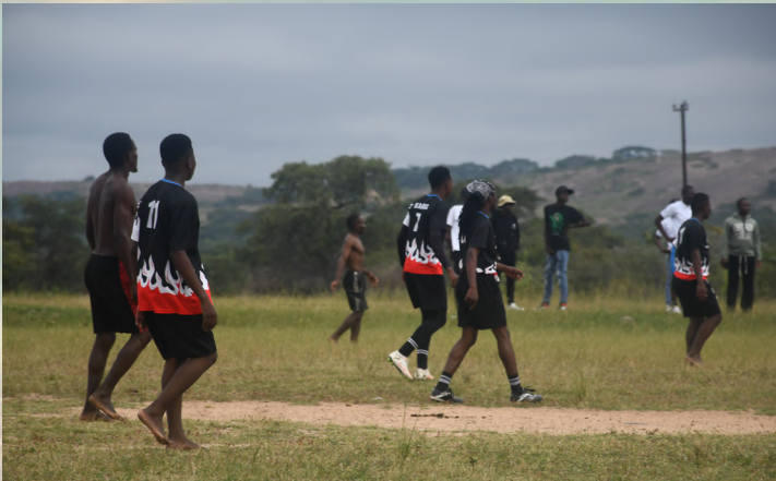
Soccer players maneuver across the soccer field