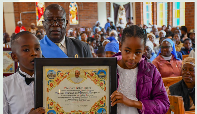
Children walk in a procession carrying the certificate.

Easter is the feast of hope. A lasting marriage, especially in today's world, is a powerful sign of hope to the Church and society. It reflects the hope that love, rooted in Christ, is possible and fruitful.