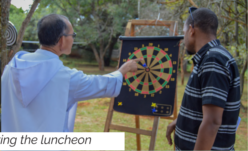
Priests interact during the luncheon