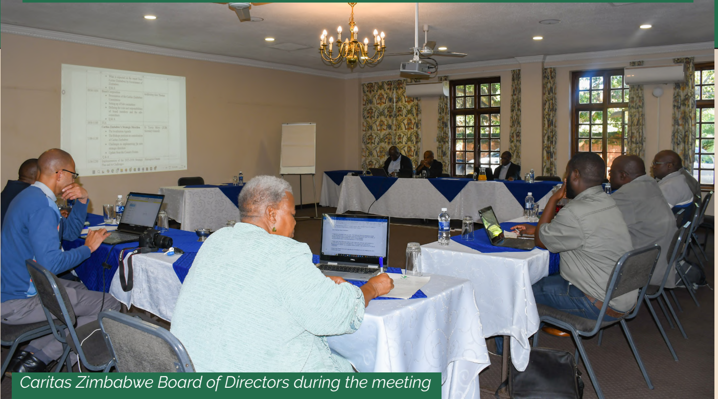
Caritas Zimbabwe Board of Directors during the meeting

Harare – The Caritas Zimbabwe Board of Directors convened its first meeting of the year in Harare on the 24th of April 2025 to evaluate progress and address challenges in implementing the organisation's strategic plan. Caritas Zimbabwe, the development and humanitarian arm of the Catholic Church in Zimbabwe, is currently operating under a five-year strategic framework launched in 2024.