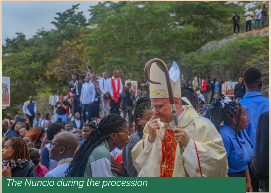
The Nuncio during the procession

to reflect deeply on love, asking, "What space does love have in your life?" and challenged them to consider what Jesus sees when He looks at them. "He sees both your fragility and your deep desire to be loved," the Nuncio said. He reminded the youth that love, happiness, and the call to eternal life are central to their Christian journey. Adding to the spiritual reflection, international guest speaker