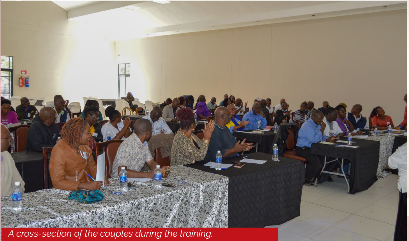
A cross-section of the couples during the training.

H arare – In a bold step to fortify the institution of marriage and family life in Zimbabwe, the Zimbabwe Catholic Bishops' Conference (ZCBC), through its Family and Marriage Apostolate, successfully conducted a five-day Training of Trainers (ToT) workshop under the Faithful House programme. Held from Tuesday, 29 April to Friday, 2 May 2025, the national workshop brought together married couples from across the country for an intensive and transformative experience.