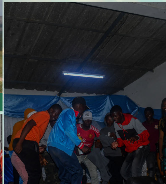
Attendees sway, so lost in rhythm