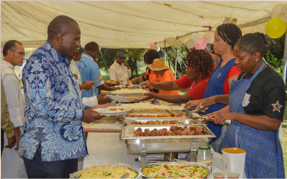
Priests being served lunch

With a heart sunk in faith, he wakes up each morning to serve. He celebrates the holy Mass, sharing the Word of God with his parishioners. As a shepherd, he tends to his flock, listen, and offer counsel. He visits the sick, bringing comfort and hope to those in need. His collar is a symbol of his commitment to serve and love. He is a teacher, a mentor, and a friend, guiding others on their spiritual journey. In times of joy and sorrow, he is there to offer support and guidance. His life is one of service, sacrifice, and love, following in the footsteps of Christ. As a priest, he is humbled and honored to serve the Lord and His people. Who can deny that priests are the unsung heroes of our communities, selflessly spreading love, kindness, and compassion on a daily basis? With such weight of his sacred duties upon his shoulders, he carries the burdens of his flock each day; surely, he deserves a moment of rest and solace.