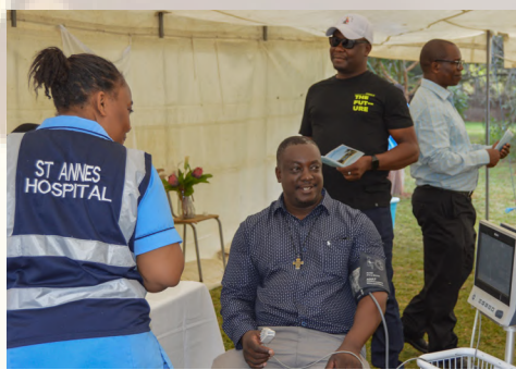
A nurse checks the priests health

The Mass began with a small group of priests, as many others were occupied with preparations for the Requiem Mass for Pope Francis, which took place later that evening. Despite the absence of musical instruments, the Mass was a vibrant and joyful celebration, disproving the common misconception that music and drumming are necessary for