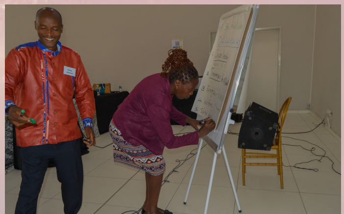
One participant writes down one of the listed responsibilities

In this Jubilee Year themed Pilgrims of Hope, the Church in Zimbabwe continues to champion strong, faith-filled families—the domestic Church. The Faithful House programme stands as a response to Pope Francis's call for renewed pastoral accompaniment, offering couples the tools to build homes rooted in love, faith, and enduring hope.