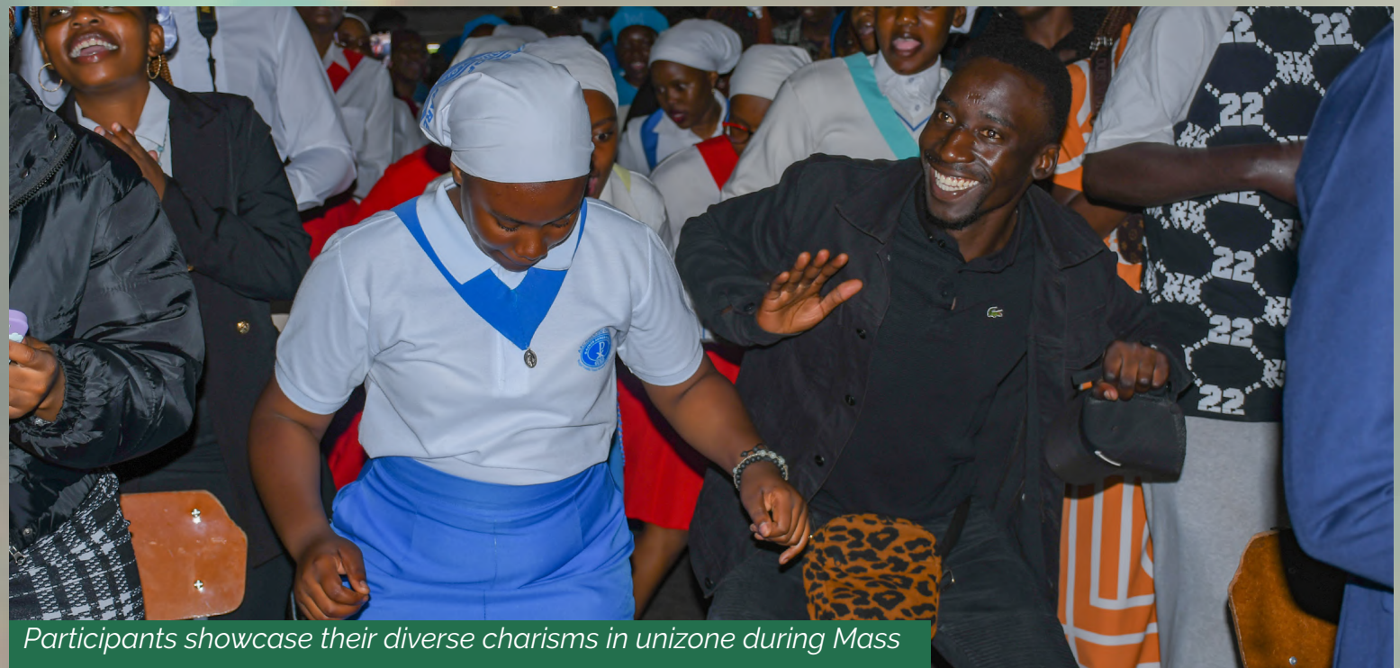
Participants showcase their diverse charisms in unizone during Mass