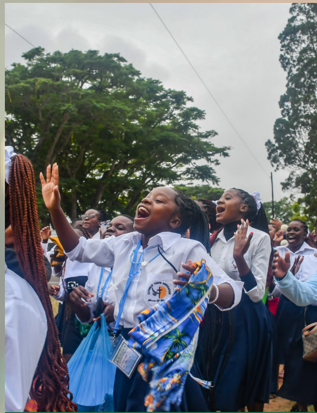
Participants move joyfully to the Shrine

With a packed programme of talks, liturgical celebrations, and recreational activities, the congress encouraged the young people to become more deeply engaged in the life of the Church and to play an active role in shaping the social and political fabric of