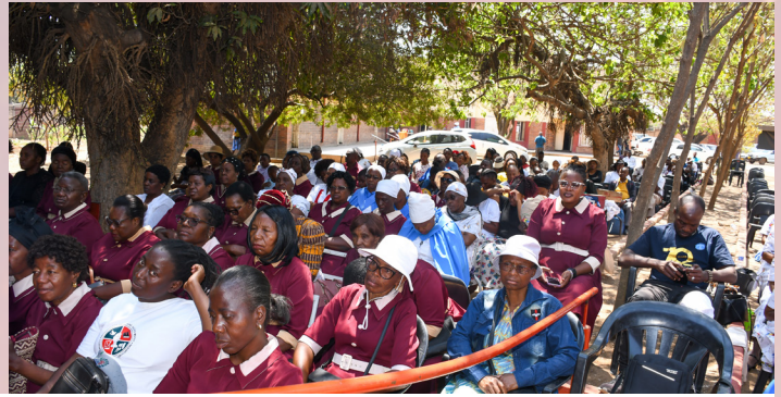
The faithful follow Mass proceedings keenly