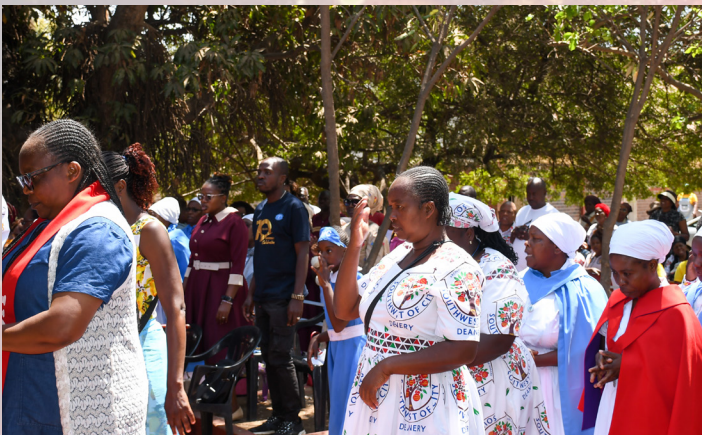
United in faith, congregants follow the sacred proceedings