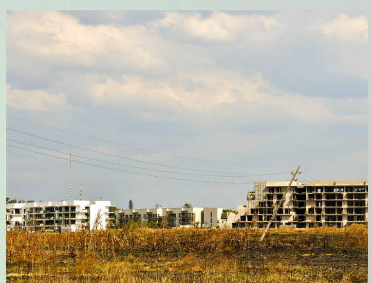
Buildings in one of Harare's affluent northern suburbs stand on a wetland

The barons are not hunted because they are