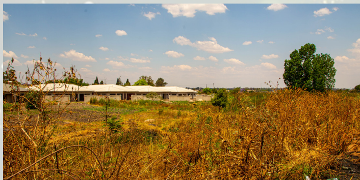
Irregular and unplanned settlements threaten wetlands, ultimately endangering the environment and climate.