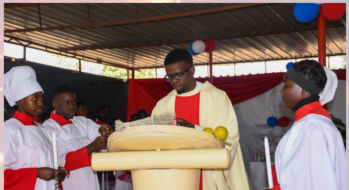
A priest reads the gospel

The historic celebration marked not only a spiritual milestone for the Archdiocese of Harare but also a renewed commitment to live out its patron's mission — to love, serve, and restore dignity to all God's people.