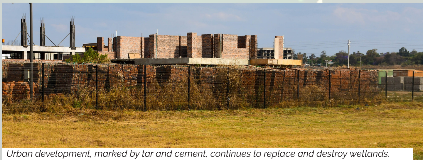
Urban development, marked by tar and cement, continues to replace and destroy wetlands.

"Until justice pierces the armour of politics, the dream of smart cities will remain an illusion."