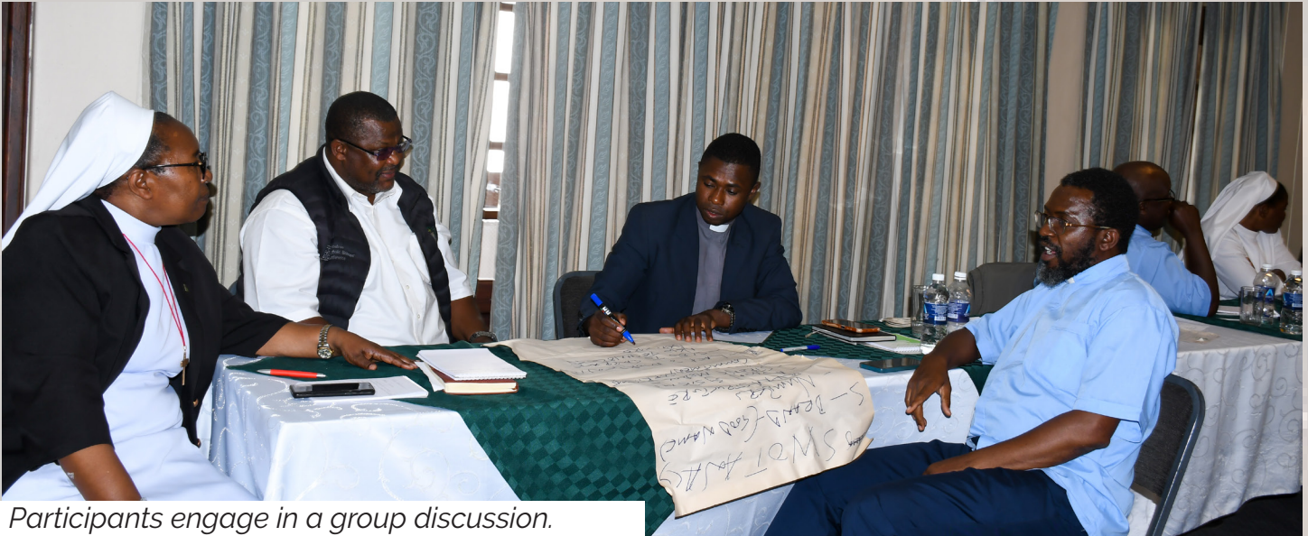
Participants engage in a group discussion.

When the Education Commission of the Zimbabwe Catholic Bishops' Conference (ZCBC) met in Harare on 11 September 2025, one theme underpinned all its discussions — the need to strengthen integrity and accountability within Catholic education.