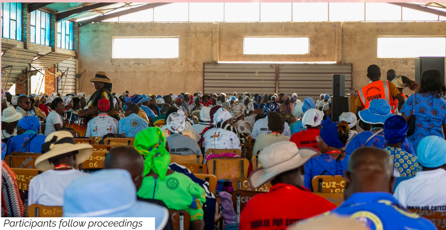
Participants follow proceedings

Harare- The Catholic University of Zimbabwe came alive from 27 to 28 September 2025 as more than 1,000 catechists from across the Archdiocese of Harare gathered to celebrate their Jubilee—joining the global Catholic Church in honouring the vocation of catechists.