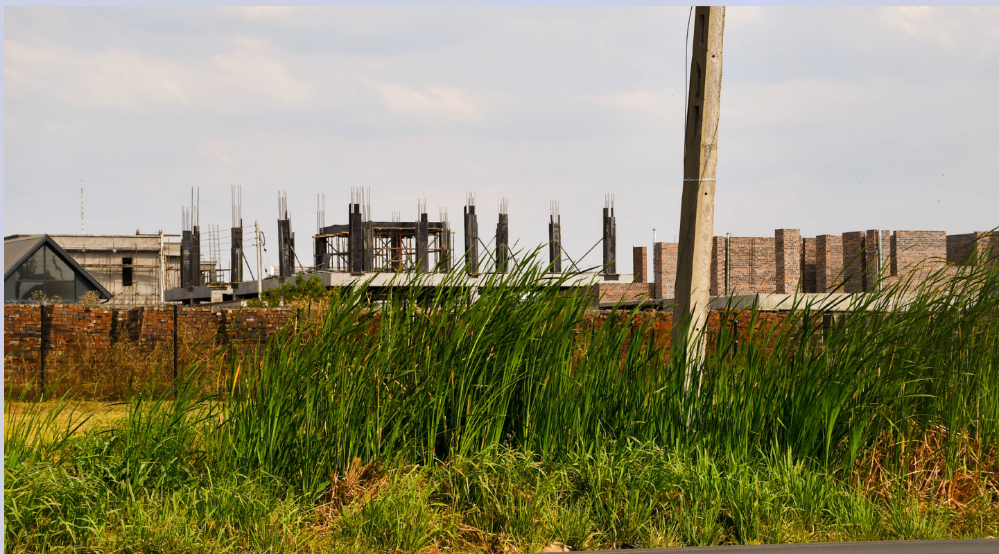
A gated community in one of the upmarket suburbs in Harare, built on visible wetland

Zimbabwe's cities are growing rapidly, but not always in harmony with sound planning, environmental protection, or public health.