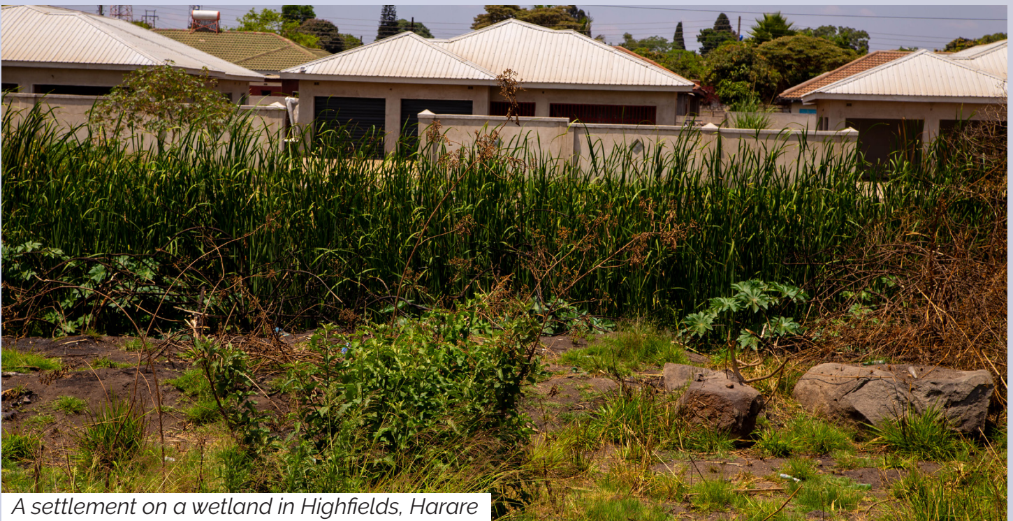
A settlement on a wetland in Highfields, Harare

"Without addressing the moral rot, regularisation will only legitimise illegality."