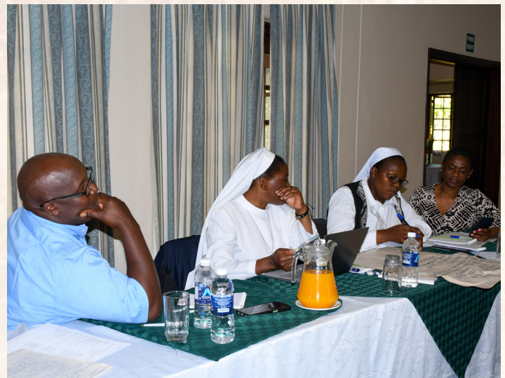
Participants offer thoughtful observations

The task ahead is not only to teach children how to think but what to live for. In every transparent ledger, every safeguarded child, and every teacher who models integrity, the Church proclaims that education is still its most enduring act of evangelisation—an education not merely for survival, but for salvation.