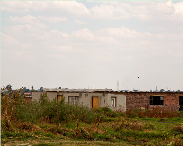
An irregular settlement built on a wetland in Budiriro